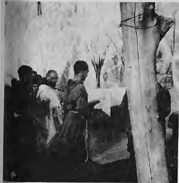
After the walls were completed, they were blessed with a solemn procession on February 2, 1972.